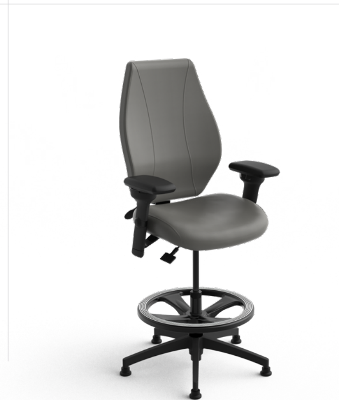
airCentric® H2S Lab Stool