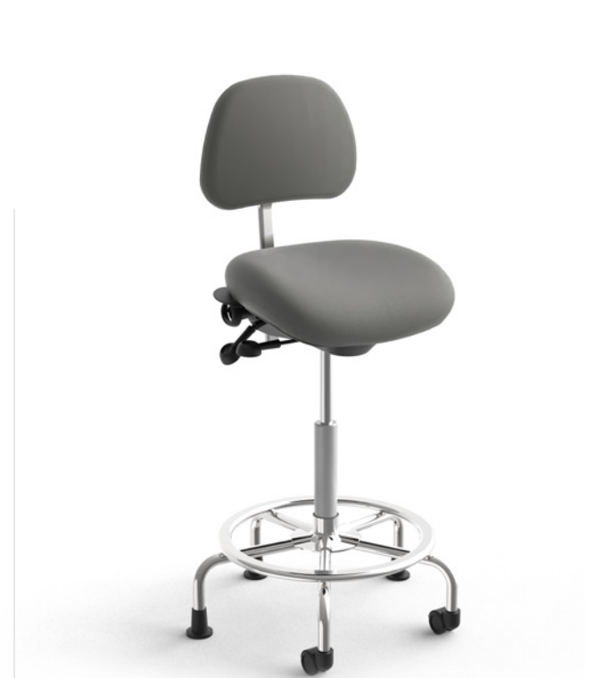
healthCentric Sit Stand