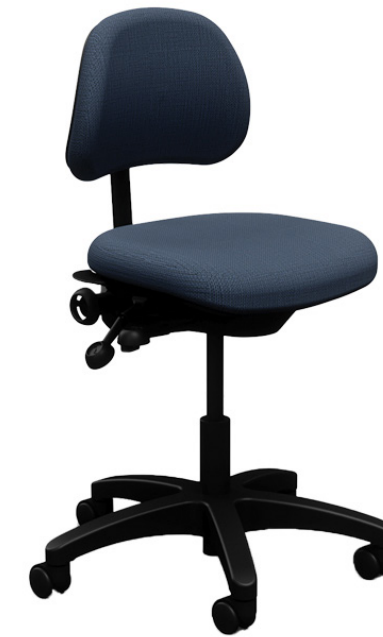
healthHcentric Technician Stool