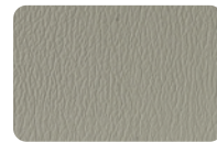
Light Grey [FRIXLGR]