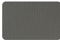
Dark Grey [FRIXDGR]