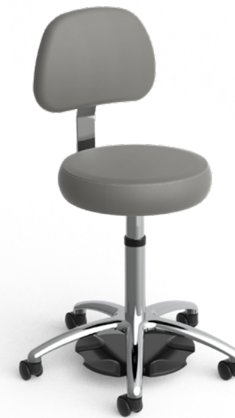
Ultimate Medical Stool