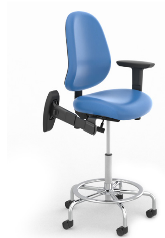
healthCentric Lab C24 Stool