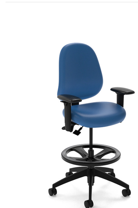
healthCentric Lab FR Stool