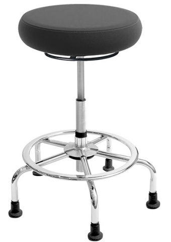
healthHcentric C22 Stool