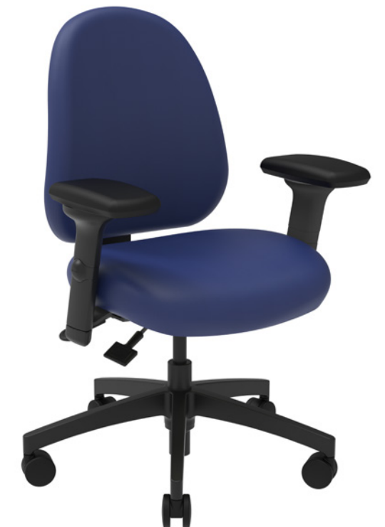
nurseCentric Dedicated Task Chairs

Investing in ergonomically designed chairs like the nurseCentric highlights a healthcare facility's commitment to the well-being of its nursing staff. These chairs help prevent fatigue and enhance comfort, leading to higher employee satisfaction. Satisfied employees are more likely to remain loyal, improving retention rates. Furthermore, when nurses are comfortable and free from discomfort, they can perform their duties more efficiently and with better focus. This not only benefits the nurses but also improves patient care quality, underscoring the importance of prioritizing nurse comfort and safety.